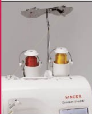
Auto Thread Exchanger™