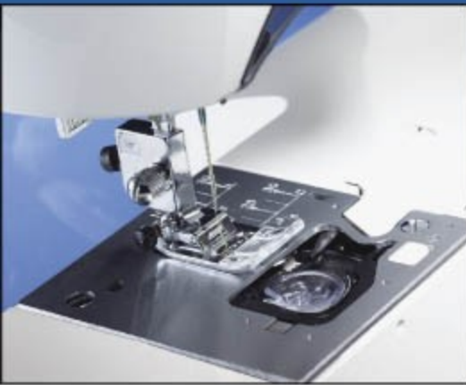
Wind-In-Place Bobbin System™