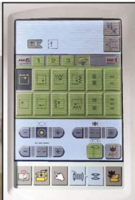
Sideways Sewing Selector